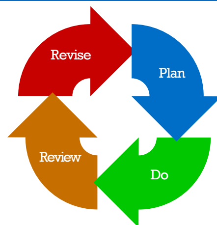
① Performance Management Cycle

Performance management is everyone's responsibility. It is also part of our day-to-day operation. The Council's performance management framework approach recognises the diversity of our business, and is mindful that services already respond to a wide range of other performance management arrangements, for instance, statutory requirements from government or through partnership working arrangements. As a result, our framework seeks to build on the systems and processes already in place.